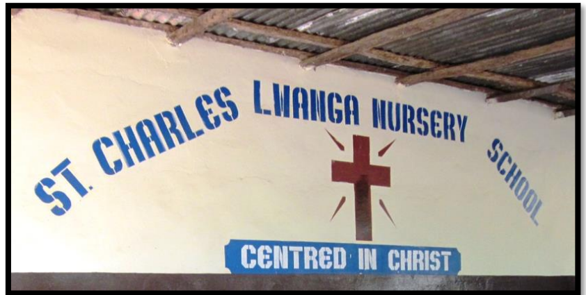
Fajikunda nursery school

In addition to formation, the Fajikunda community was involved in education, parish ministry and the promotion of women.