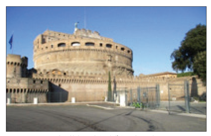
CASTEL SANT'ANGELO Gathering place at 3:30PM